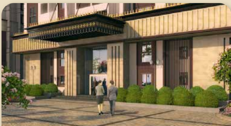
The Hub Club @ Ohana