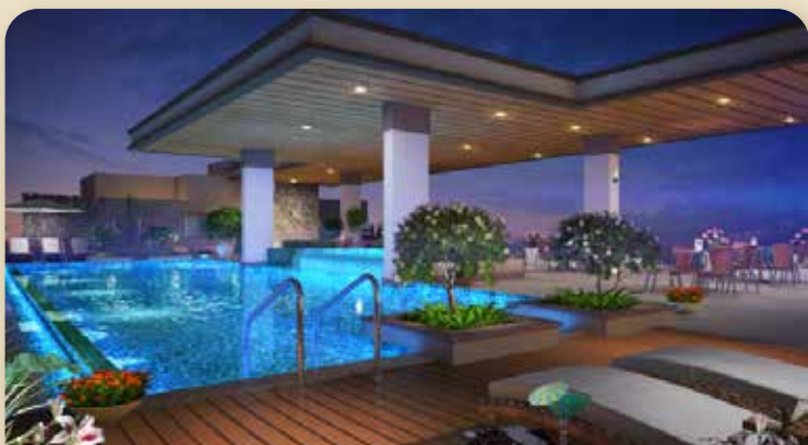
Ohana - The Sky Pool