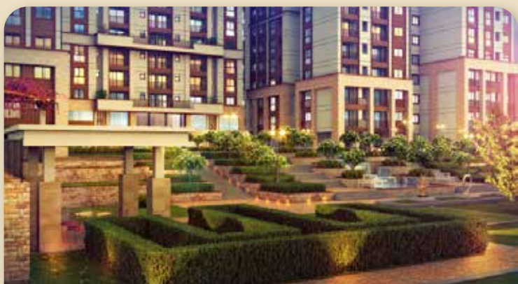
Ohana - Manicured Gardens